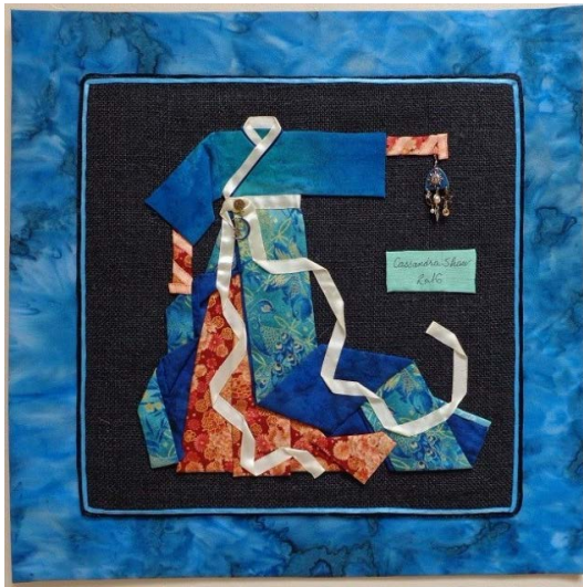
Eastern Highlands White Ribbon Cassandra Shaw