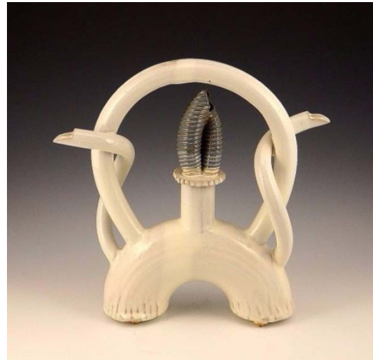
Double Spout Ewer Marc Hudson